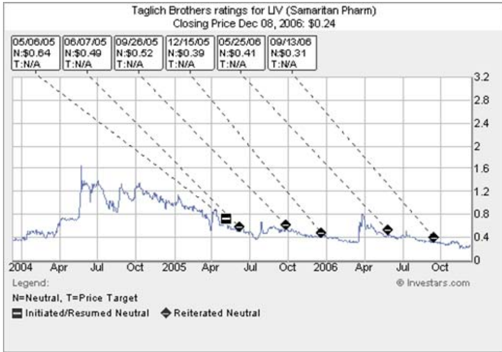
Taglich Brothers Current Ratings Distribution